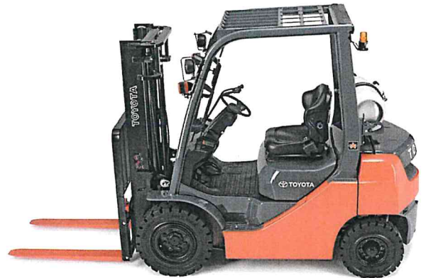
Photo may portray optional equipment not included in your quotation.