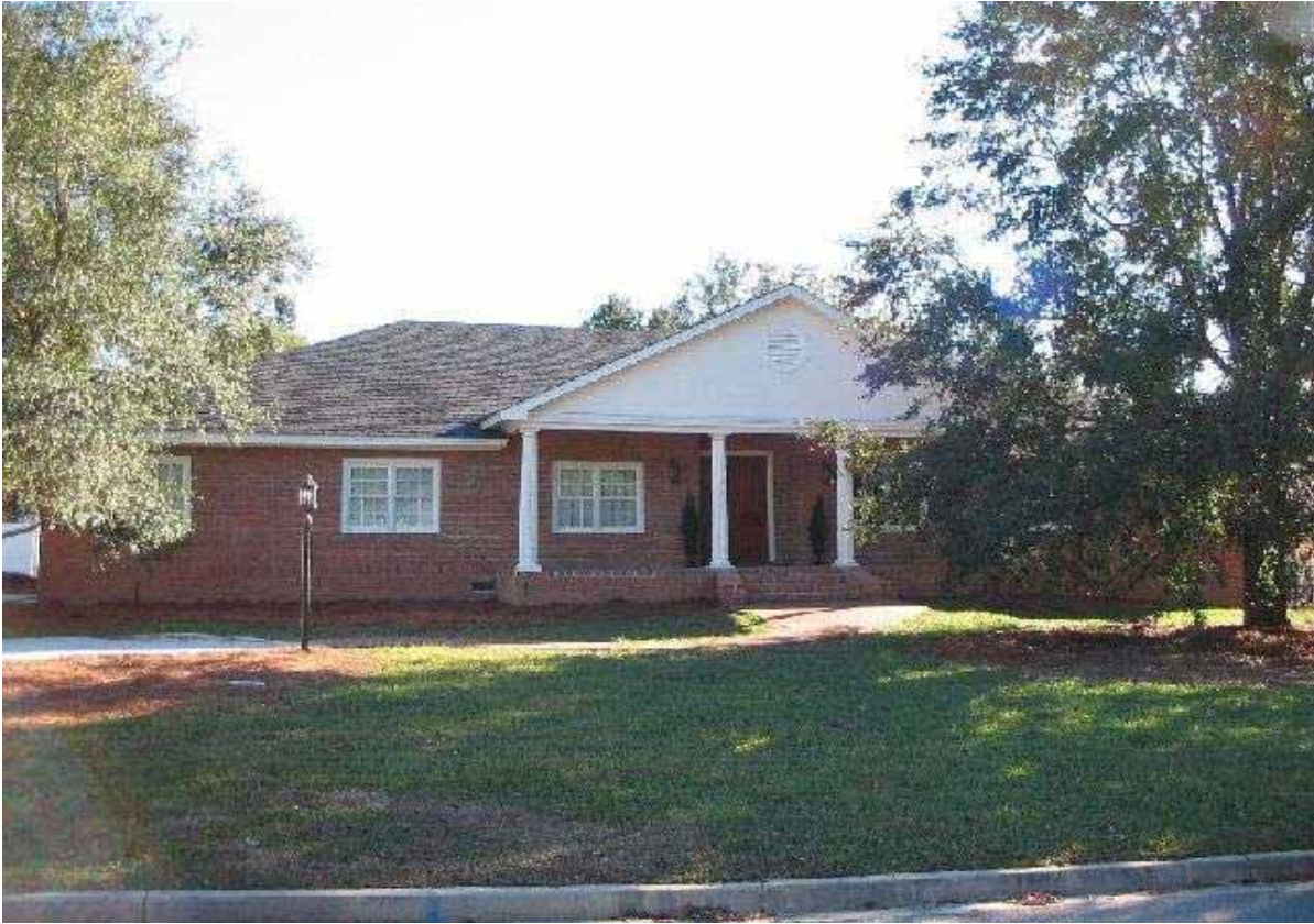
LC Tax Assessor photo - 2005